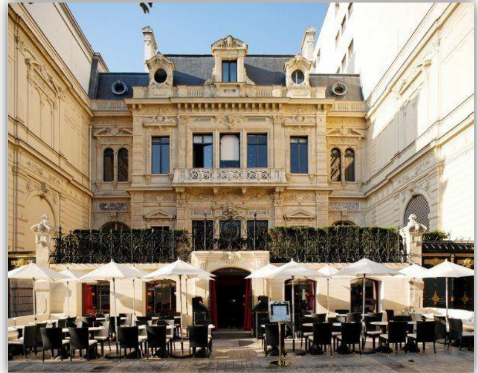
The Travellers Club, 25 avenue des Champs-Élysées, 75008 Paris Metro : Franklin D. Roosevelt (Line 1)

Venue: 25 avenue des Champs-Élysées, Paris 8ème